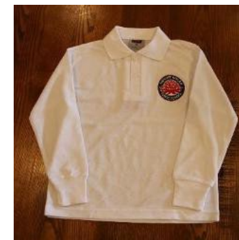
Long Sleeve Polo - unisex