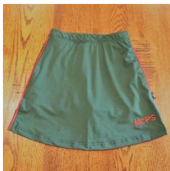
Sports skorts - girls