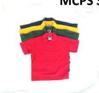
Sports House Polos Kindergarten – Year 2