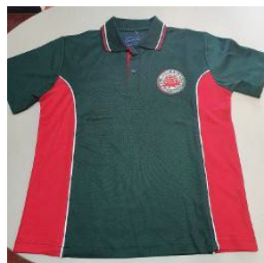
Primary Sports Polo Years 3 – 6