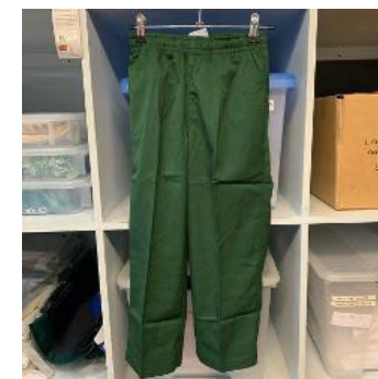
green pants - unisex