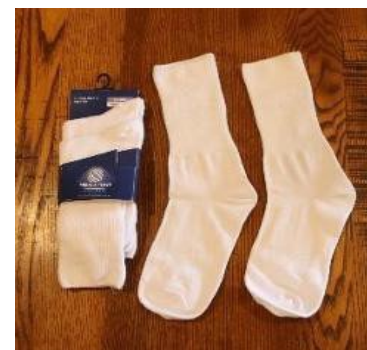
white socks - unisex