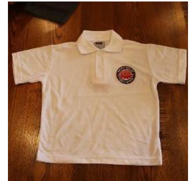
Short Sleeve Polo - unisex