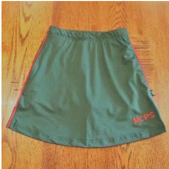
Sports skorts - girls