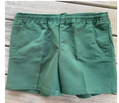
green shorts - unisex