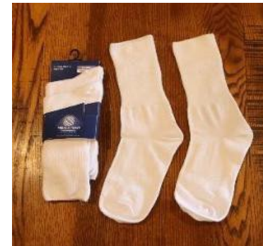
white socks - unisex