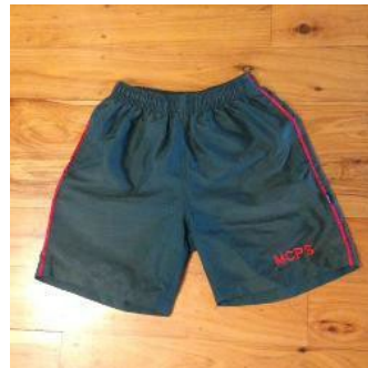
Sports shorts - unisex