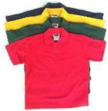
Sports House Polos Kindergarten – Year 2